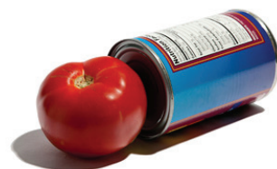
Tomato: 1 cup chopped or 1 large tomato (about 3 inches in diameter, about the size of a baseball)