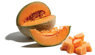
Cantaloupe: 1 cup diced or about 1/8 of a large melon