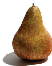
Pear: 1 medium pear