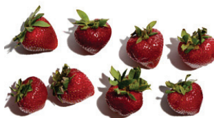
Strawberries: 8 large berries