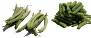
Green Beans: 1 cup cooked (we counted: It's about 19 to 20 beans)