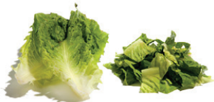
Greens, Raw (lettuce, spinach, etc.): 2 cups (about two large leaves of chopped romaine)