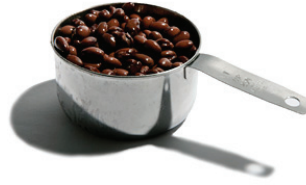
Beans, Cooked (black, garbanzo, etc.): 1 cup