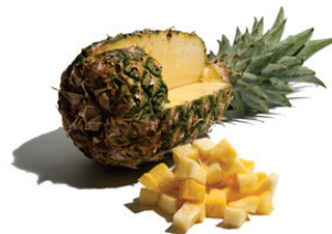
Pineapple: 1 cup chopped (a little less than 1/4 of a pineapple)