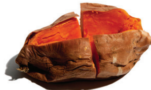
Sweet Potato: 1 cup mashed or 1 large baked potato (about 2 1/4 inches in diameter)