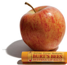
Apple: 1 small apple (about 2 1/2 inches in diameter, a little smaller than a baseball)