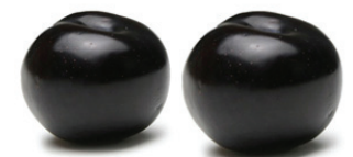
Plum: 2 large plums