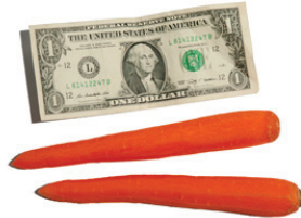
Carrots: 1 cup chopped or 2 medium whole carrots (6 to 7 inches long)