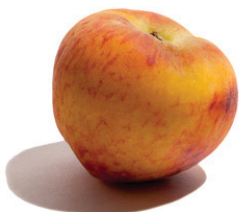
Peach: 1 large peach (about the size of a tennis ball)