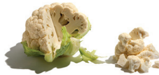
Cauliflower: A little less than a 1/4 head of florets