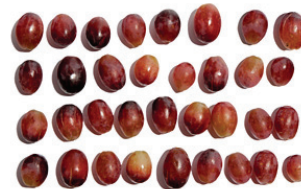
Grapes: About 32 average grapes