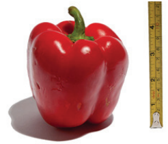
Bell Pepper: 1 cup chopped or 1 large pepper (about 3 inches in diameter)