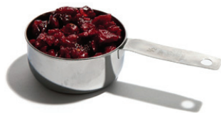
Dried Fruit: 1/2 cup