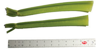
Celery: 1 cup diced or 2 stalks (11 to 12 inches long)