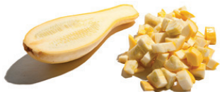
Summer Squash: 1 cup cooked/sliced/diced squash or 1 whole zucchini (7 to 8 inches long) or about 1/2 of a large yellow crookneck