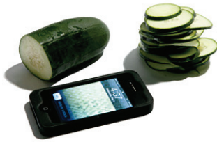
Cucumber: 1 cup sliced/chopped or about 1/2 of a medium cucumber (8 to 9 inches long)