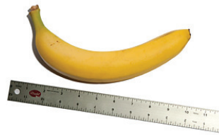
Banana: 1 large banana (8 to 9 inches long)