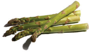
Asparagus: About 4 spears