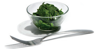
Greens, Cooked (kale, chard, etc.): 1 cup