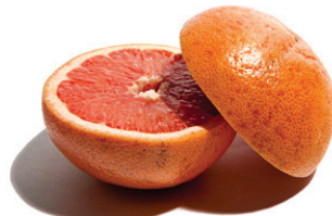
Grapefruit: 1 medium grapefruit (about 4 inches across)