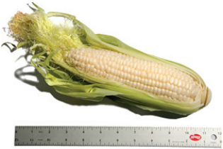
Corn: 1 cup of kernels or 1 large ear (8 to 9 inches long)