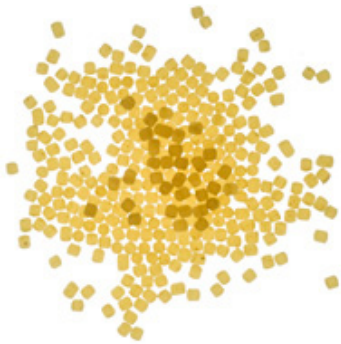
ACINI DI PEPE

Here's a guide to help you tell your paccheri from your penne, your rotelle from your rotini. For more info on the sauces for each pasta, go to www.chow.com/stories/11099 .